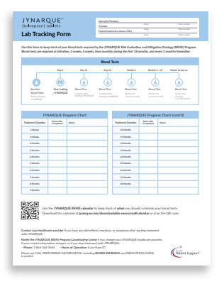
Lab Tracking Form