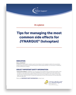
Tips for Side Effect Management While on Treatment with JYNARQUE