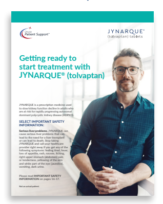
Getting Ready to Start Treatment With JYNARQUE Patient Brochure

Download and print these 6 take-home resources for your patient